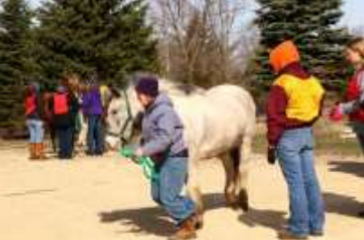
Mock Novice Ride! April 9<sup>th</sup> – 27 new riders!